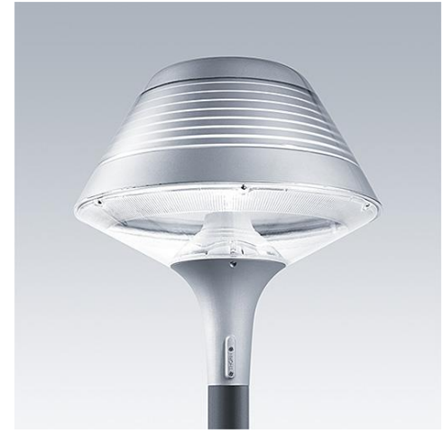
Photographs, line drawings and photometric data are representative only. For specific product detail please select an individual product.