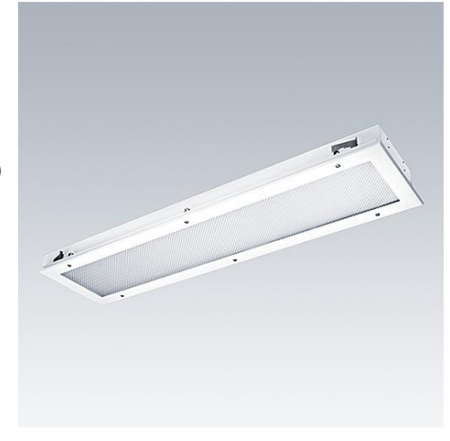
Photographs, line drawings and photometric data are representative only. For specific product detail please select an individual product.