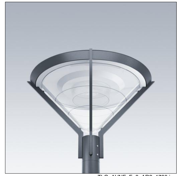
TLG AVNF F 3 AR2 1700.jpg

Dimensions: Ø700/720 x 500 mm Luminaire input power: 40 W Weight: 9 kg Scx: 0.17 m<sup>2</sup> Luminaire efficacy: 133 lm/W