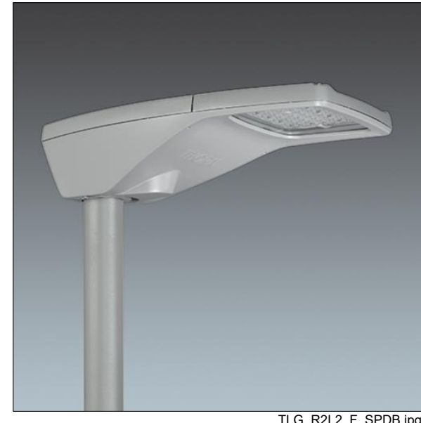
TLG R2L2 F SPDB.jpg