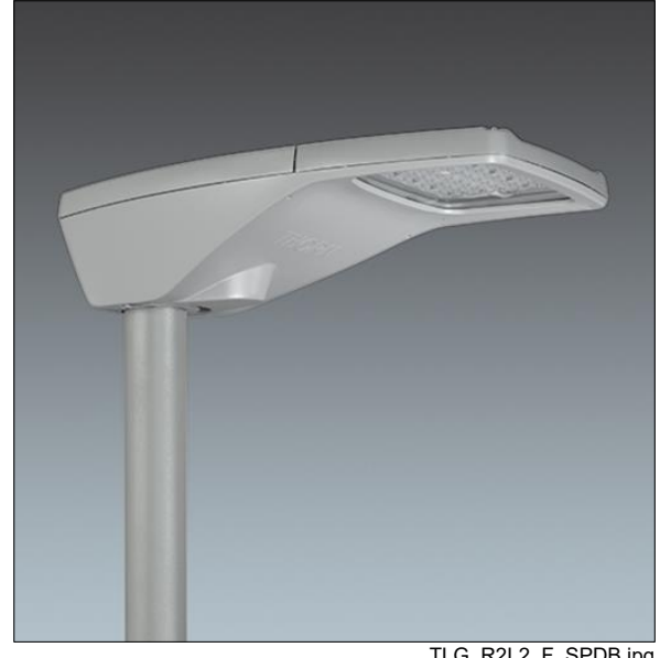
TLG R2L2 F SPDB.jpg