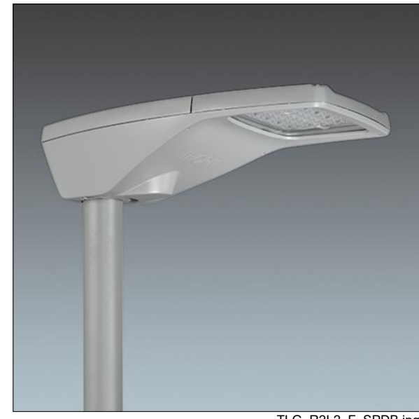
TLG R2L2 F SPDB.jpg