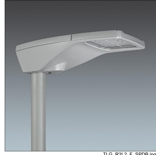
TLG R2L2 F SPDB.jpg