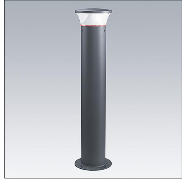
TLG ADLB F SLIMR.jpg