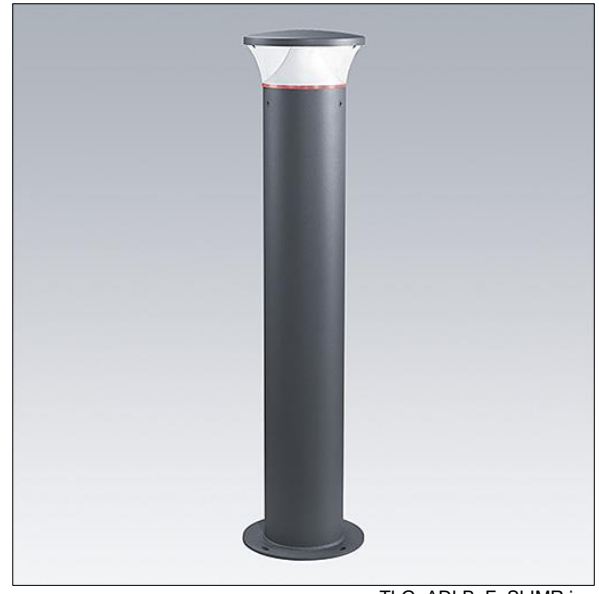
TLG ADLB F SLIMR.jpg