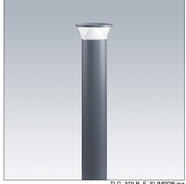
TLG ADLB F SLIMPDB.jpg