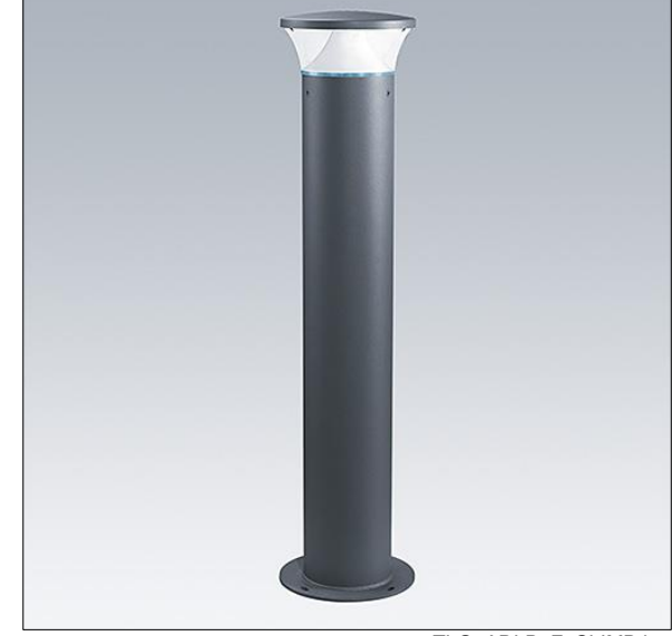
TLG ADLB F SLIMB.jpg