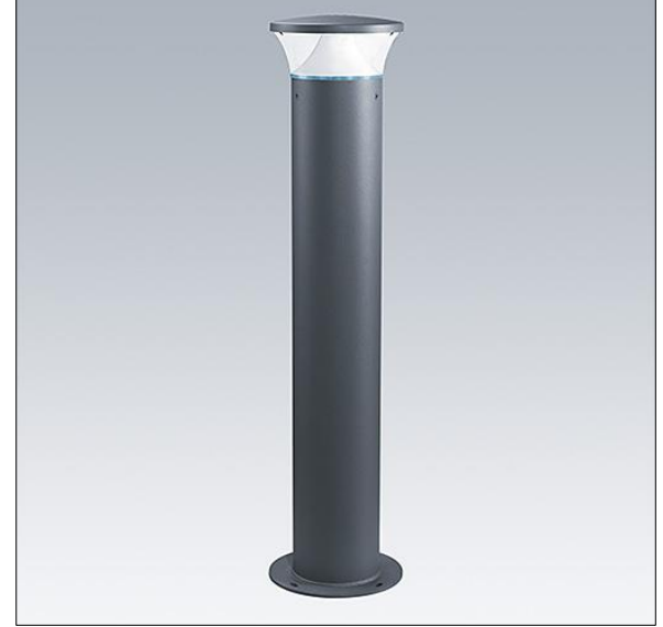
TLG ADLB F SLIMB.jpg