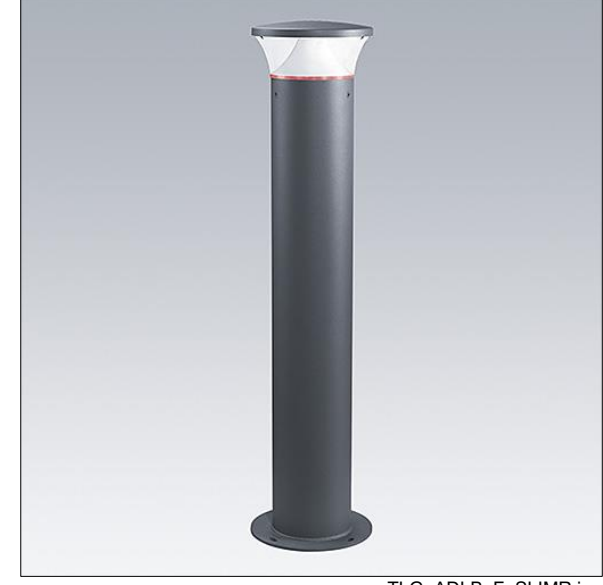
TLG ADLB F SLIMR.jpg