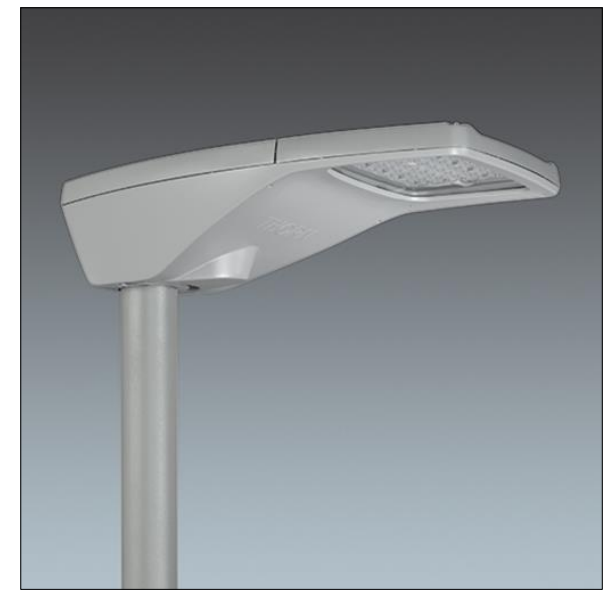
TLG R2L2 F SPDB.jpg