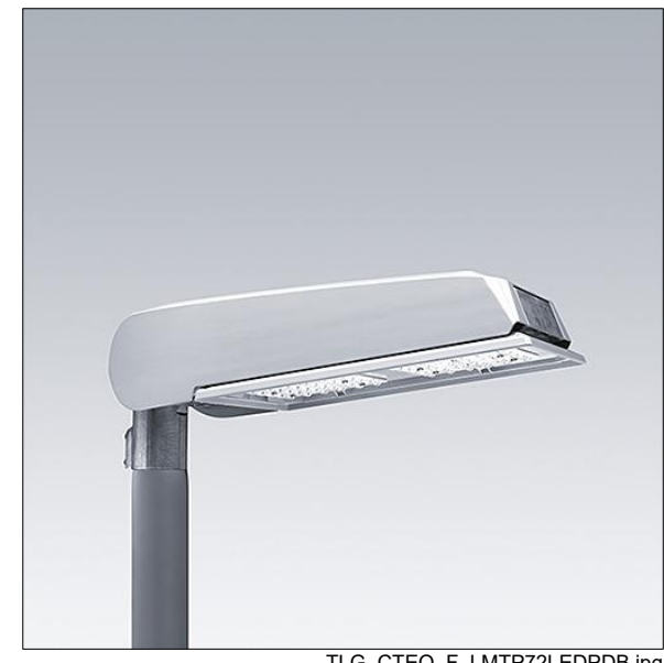
TLG CTEQ F LMTP72LEDPDB.jpg