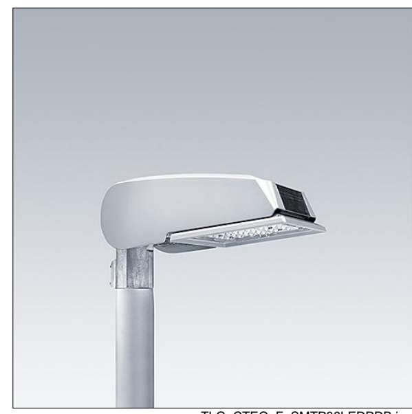
TLG CTEQ F SMTP36LEDPDB.jpg