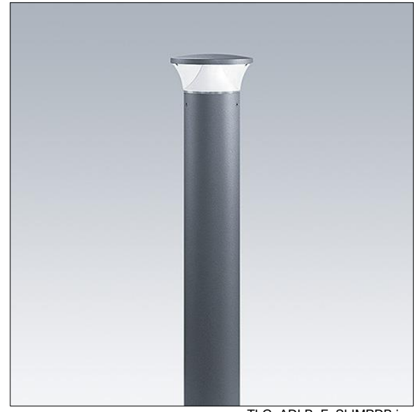
TLG ADLB F SLIMPDB.jpg