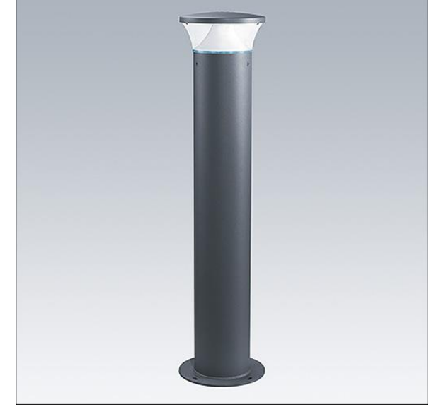
TLG ADLB F SLIMB.jpg