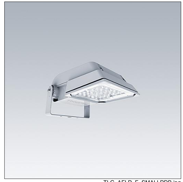
TLG AFLP F SMALLPDB.jpg