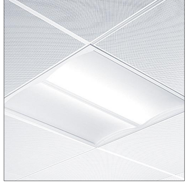
TLG IQWV F PDBCEILING.jpg