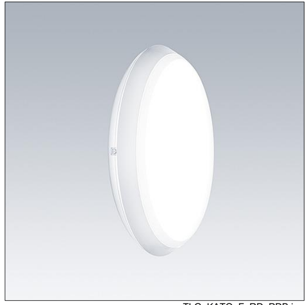
TLG KATO F RD PDB.jpg