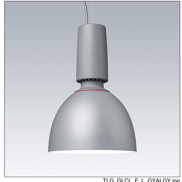
TLG GLCL F L GYALGY.jpg