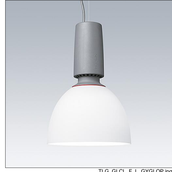
TLG GLCL F L GYGLOP.jpg