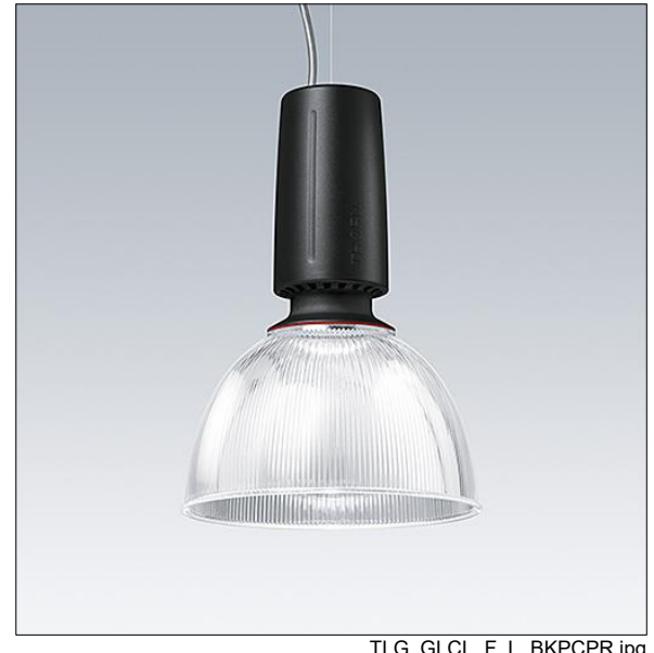
TLG GLCL F L BKPCPR.jpg