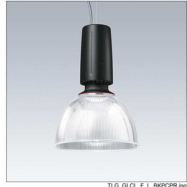
TLG GLCL F L BKPCPR.jpg