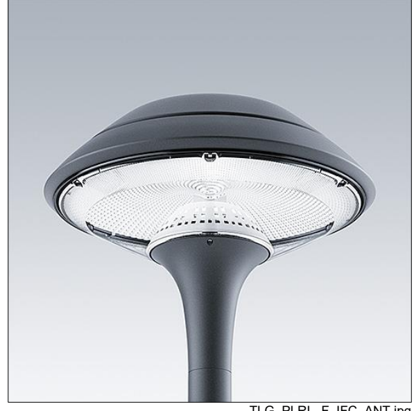
TLG PLRL F IFC ANT.jpg