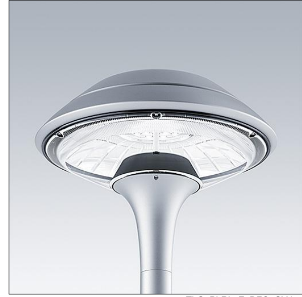
TLG PLRL F DFC GY ipg