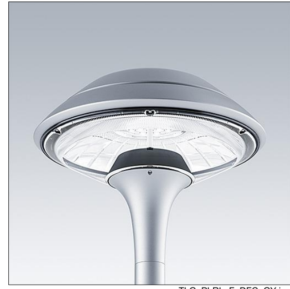
TLG PLRL F DFC GY ipg