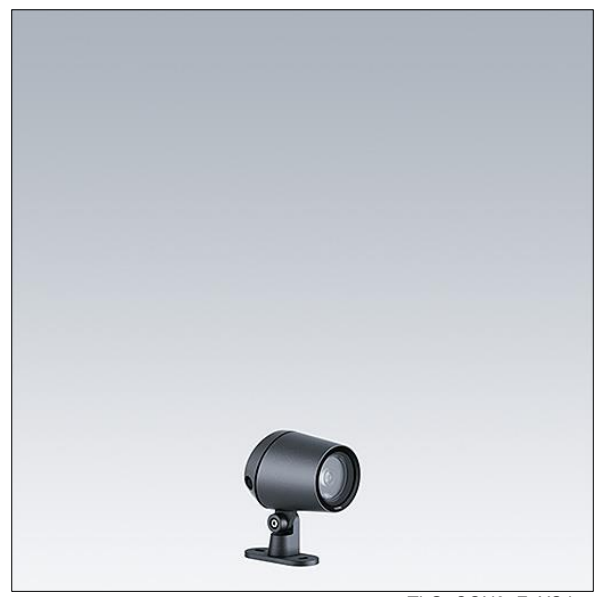
TLG CON3 F XS.jpg