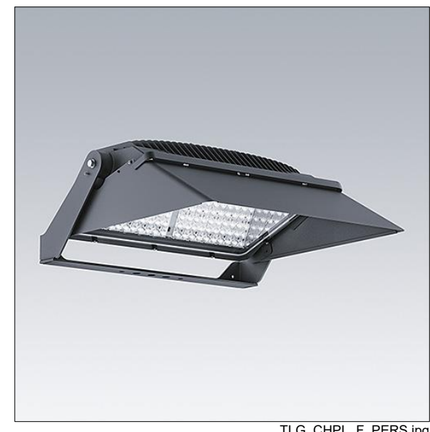
TLG CHPL F PERS.jpg

Weight: 22.4 kg Scx: 0.196 m<sup>2</sup>