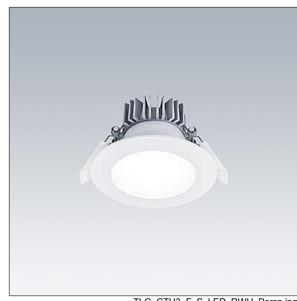
TLG CTU3 F S LED RWH Persp.jpg