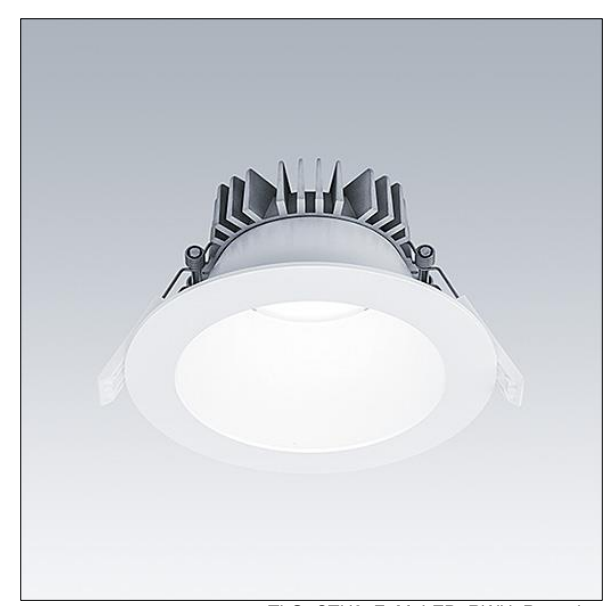
TLG CTU3 F M LED RWH Persp.jpg