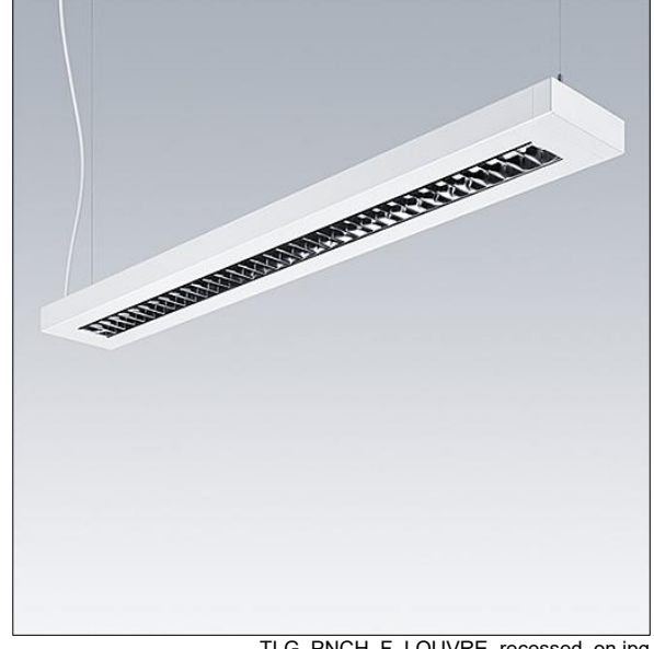
TLG PNCH F LOUVRE recessed on jpg