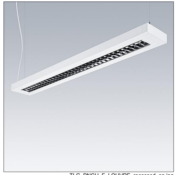
TLG PNCH F LOUVRE recessed on jpg