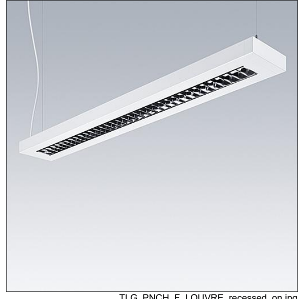
TLG PNCH F LOUVRE recessed on jpg