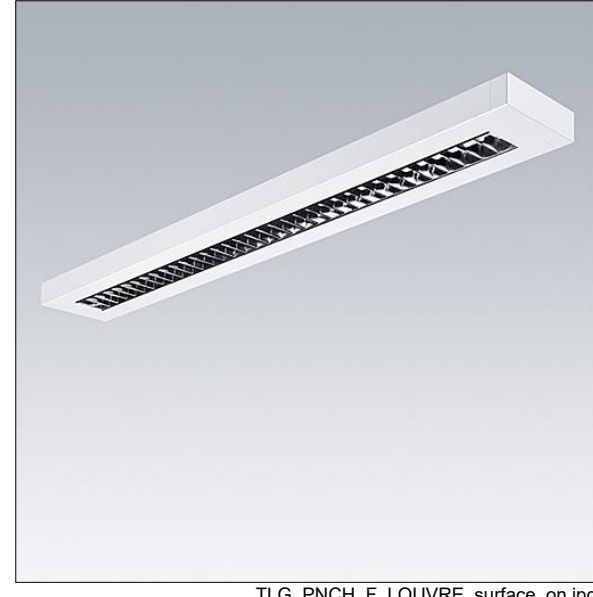
TLG PNCH F LOUVRE surface on jpg