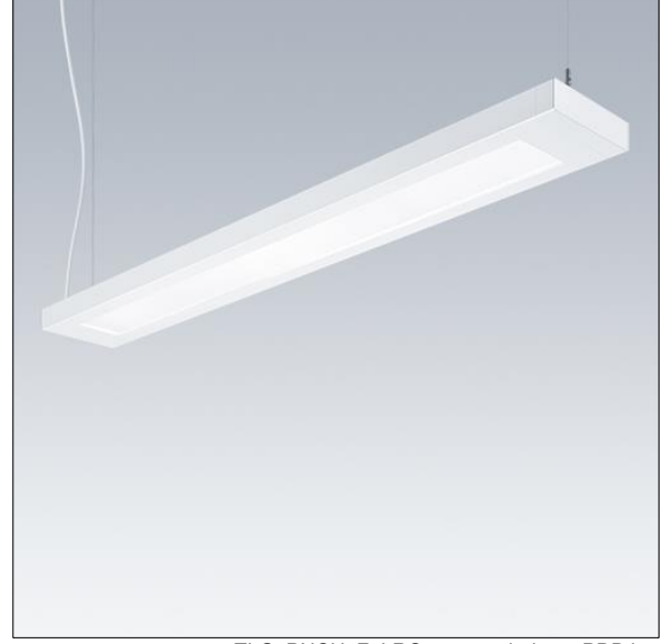
TLG PNCH F LRO suspended on PDB.jpg