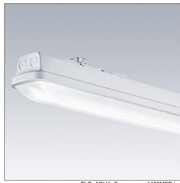
TLG AQUA F economy 1100MED.jpg

This product contains a light source of energy efficiency class D.